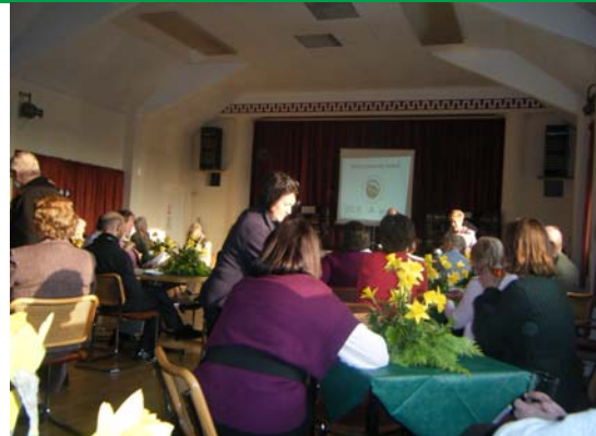
End of RCA Programme event—March 2009