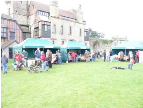
Made in Monmouthshire celebrating St David's Day at Caldicot Castle