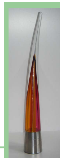
Monmouthshire — True Taste Food Tourism Destination of Wales 2008/09

More information available on www.mim.adventa.org.uk .