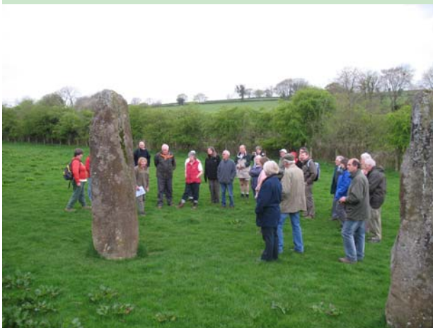
Monmouthshire Walking Weekend April 2009 — Trellech Walk.