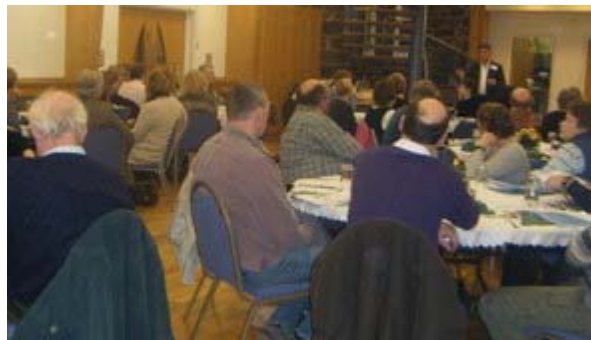
MiM Forum—February 2009