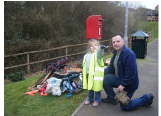
Tidy Towns: Tidy Local Communities' youngest helper!