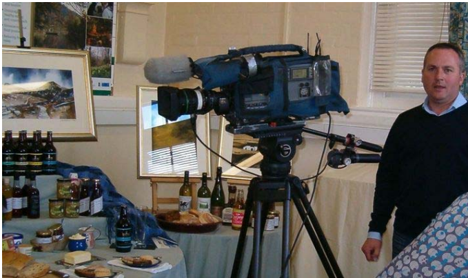
Made in Monmouthshire food, drink, art and crafts were featured in an adventa interview with HTV Wales October 2008.